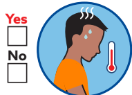
Fever > 37.8°C and/or chills