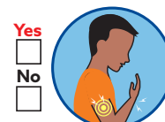
Muscle aches/joint pain