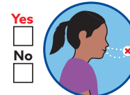
Decrease or loss of taste/smell