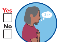
Feeling very tired