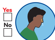
Runny nose/nasal congestion